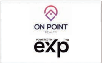
ICA/Sole Trader Agents