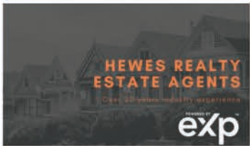
ICA/Sole Trader Agents (Retain or design your own branded templates “Powered By eXp”)